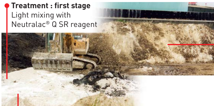
Treatment : first stage Light mixing with Neutralac® Q SR reagent