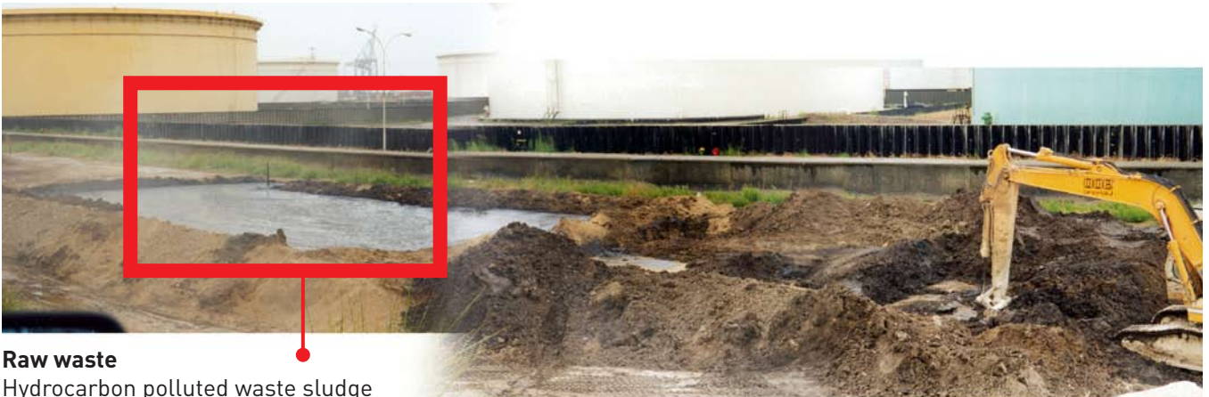
Raw waste Hydrocarbon polluted waste sludge stored near Le Havre harbour (France)